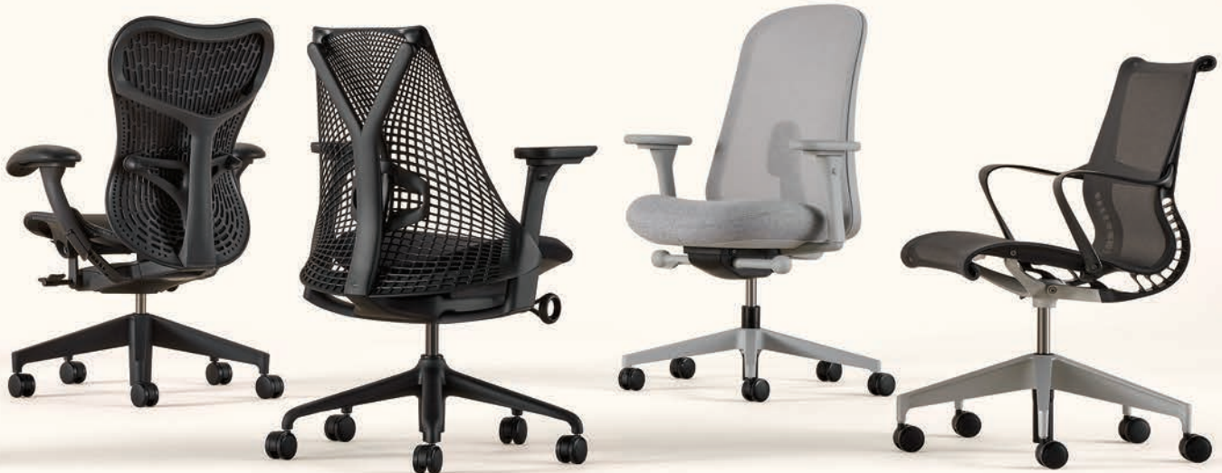
Mirra® 2 For Maximum Movement

Need more help? Find more information on hermanmiller.com/sit-well .