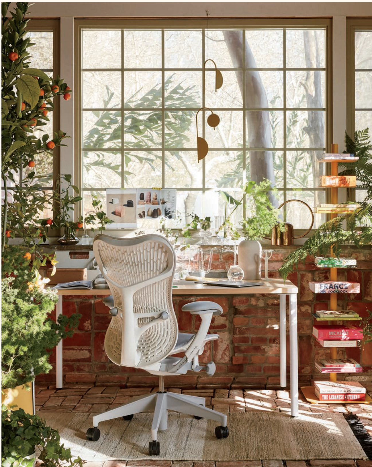
Mirra® 2 Chair $795–$1345 $676–$1143 | OE1 Table $475–$745 $404–$633 | Story Bookcase $295–$345 | Counterpoint Mobile $265–$295 (cover) Eames® Lounge Chair and Ottoman $5495–$8495 $4671–$7221 | Noguchi® Table $1995–$2295 $1696–$1951