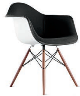
Eames Upholstered Molded Plastic Armchair