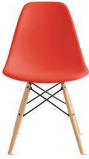
Eames Molded Plastic Side Chair

Make room for lively conversations and connections around the table.