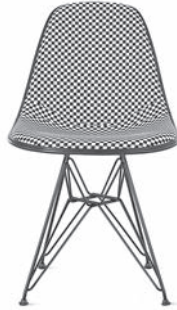
Eames Upholstered Molded Plastic Side Chair