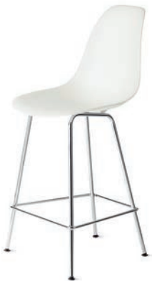
Eames Molded Plastic Barstool