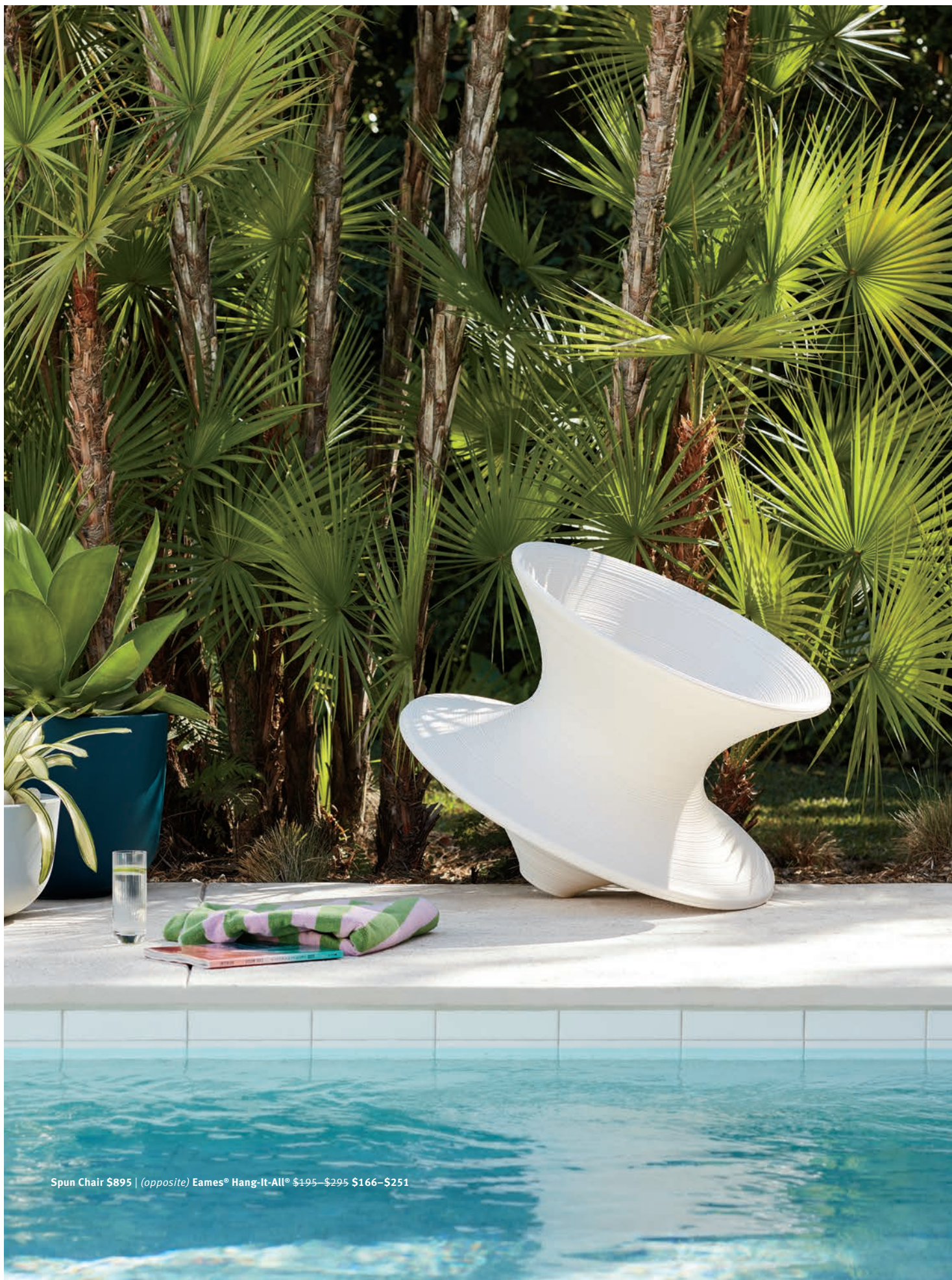
Spun Chair $895 | (opposite) Eames® Hang-It-All® $195–$295 $166–$251