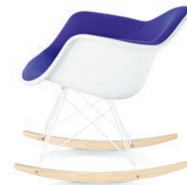
Eames Upholstered Molded Plastic Rocker