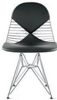
Eames Wire Chair with Bikini